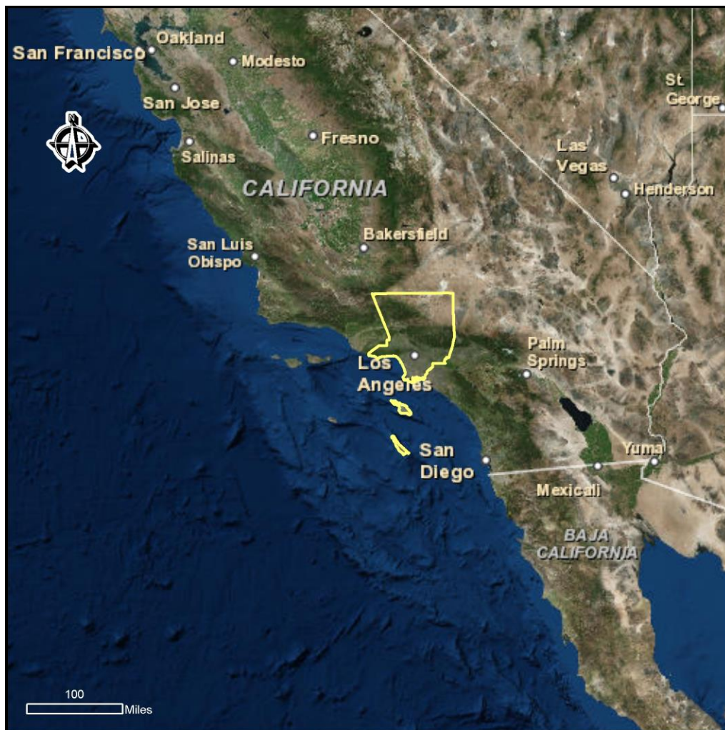
Figure 1. Locator map of Los Angeles County

The county of Los Angeles is located in southern California and is one of the most famous and highly populated counties in the United States. The county of Los Angeles has a high rate of racial diversity. The county of Los Angeles and its connecting freeways experience a high density of traffic flow due to its high rates of residential and commuter traffic. About 10 million people live and work in Los Angeles and many in the surrounding areas commute to Los Angeles for work, school and for its various attractions.